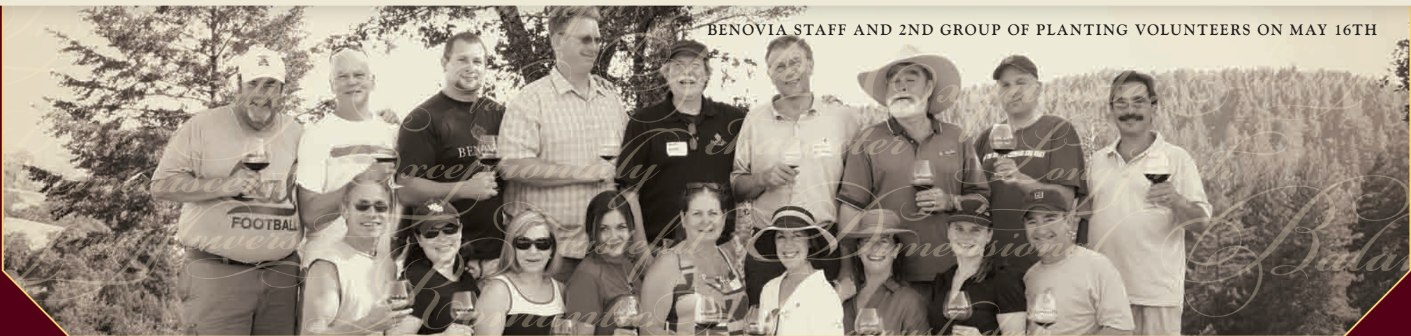
BENOVIA STAFF AND 2ND GROUP OF PLANTING VOLUNTEERS ON MAY 16TH