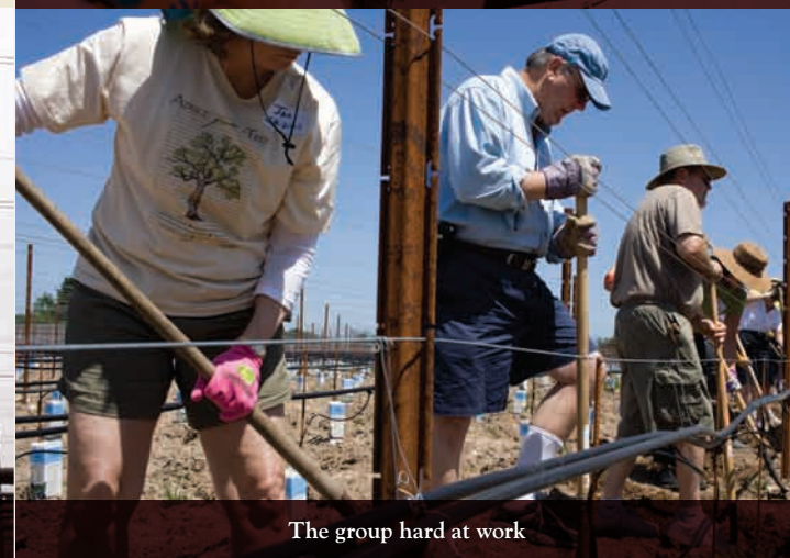
The group hard at work