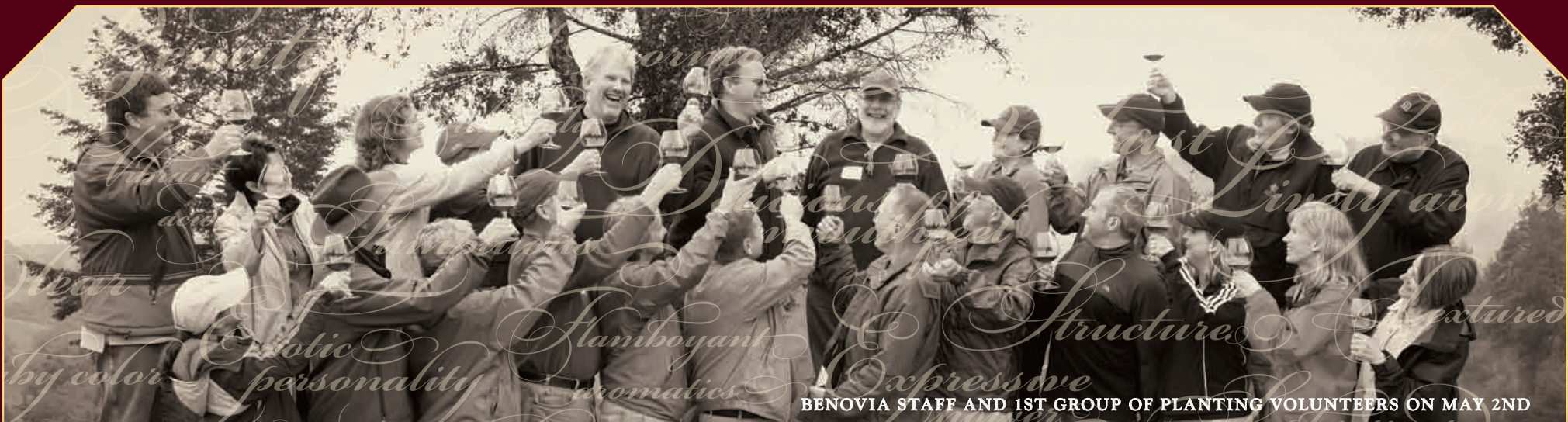
BENOVIA STAFF AND 1ST GROUP OF PLANTING VOLUNTEERS ON MAY 2ND