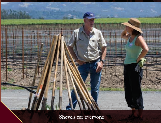
Shovels for everyone