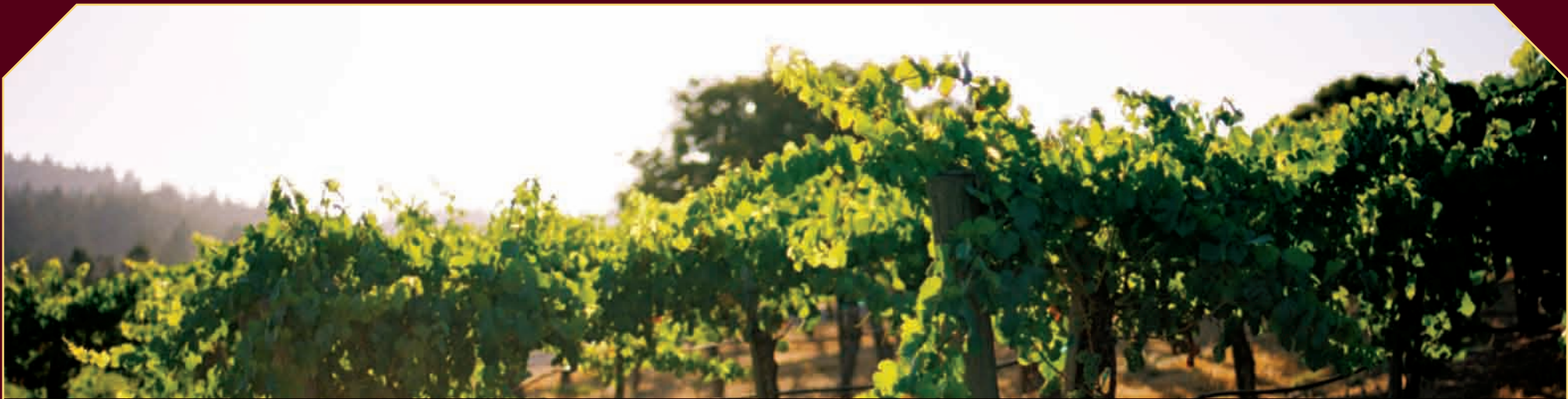
HISTORIC COHN VINEYARD, PLANTED IN 1970