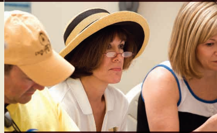
Interested volunteers taking notes to plant correctly

On May 2 and May 16, 45 dedicated wine lovers came to Benovia to help plant our new vineyards. They learned about planting Pinot Noir in particular, the details of planning a vineyard, and how important getting healthy rootstock is to the success of the vineyard. The May 2 group bravely planted in a pouring rain. The May 16 group was greeted by bright sunshine. Both groups were a joy to be with and all have been officially knighted as Benovians. The vines they planted will be marked with plaques, bearing the planters' names so they may track the vines' progress each time they visit the winery in coming years.