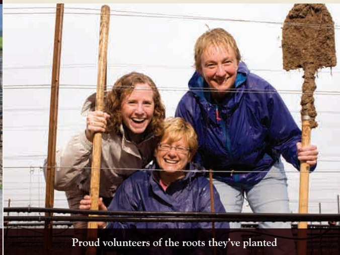
Proud volunteers of the roots they've planted