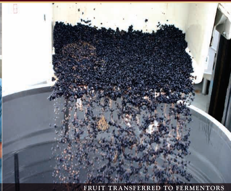
FRUIT TRANSFERRED TO FERMENTORS

“Winemaking is about the journey and not the destination . . .”