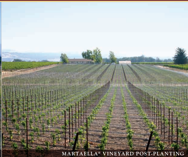
MARTAELLA® VINEYARD POST-PLANTING