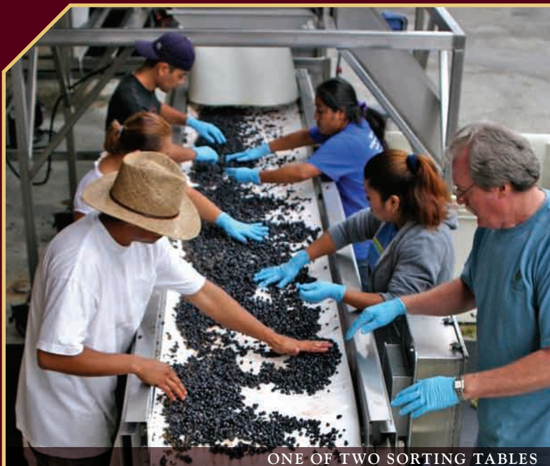
ONE OF TWO SORTING TABLES