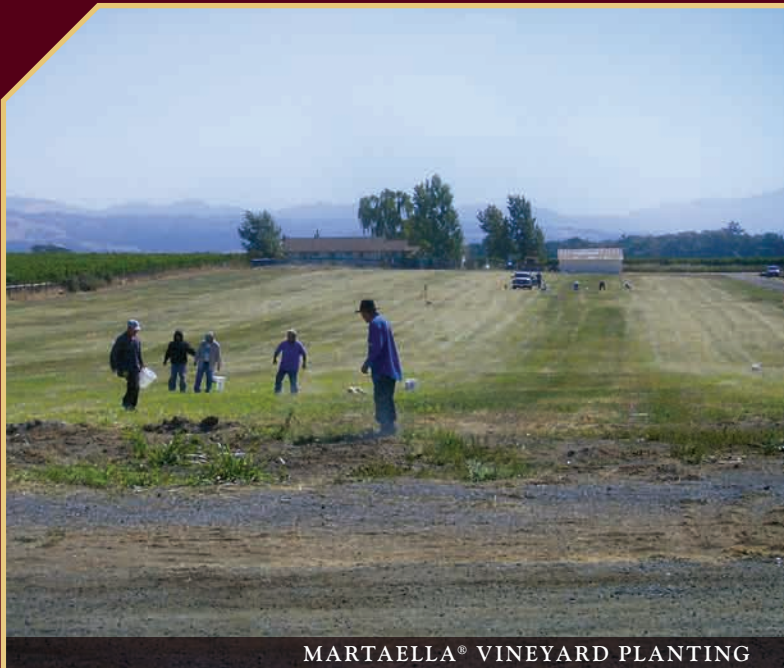
MARTAELLA® VINEYARD PLANTING