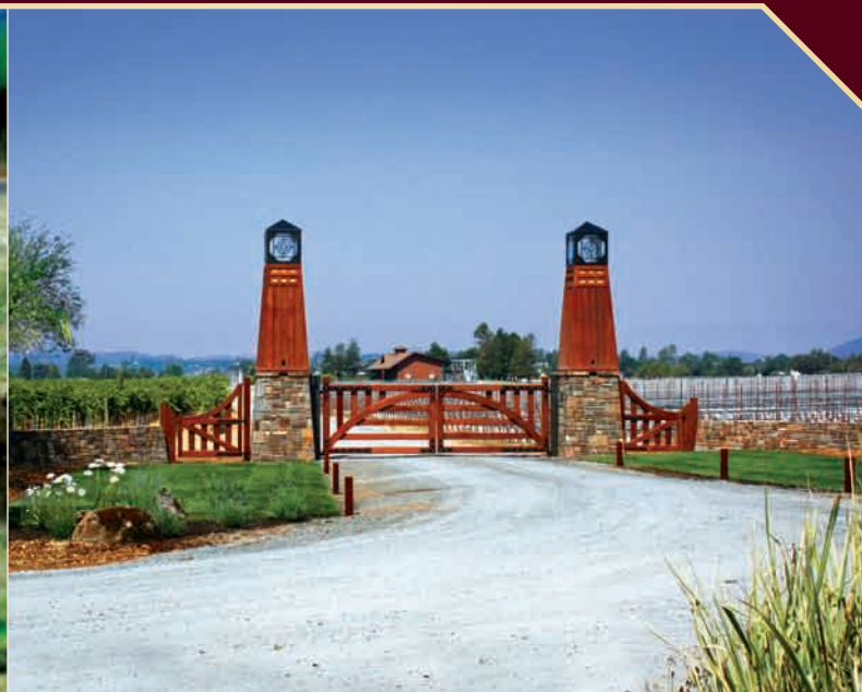
NEW ENTRANCE TO THE WINERY