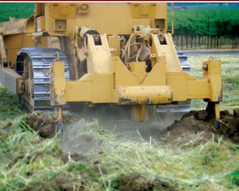
CONSTRUCTION ON THE NEW VINEYARD