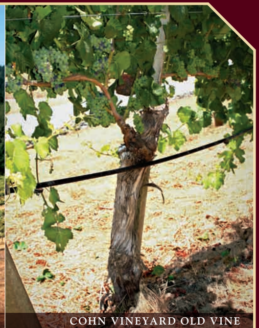
COHN VINEYARD OLD VINE