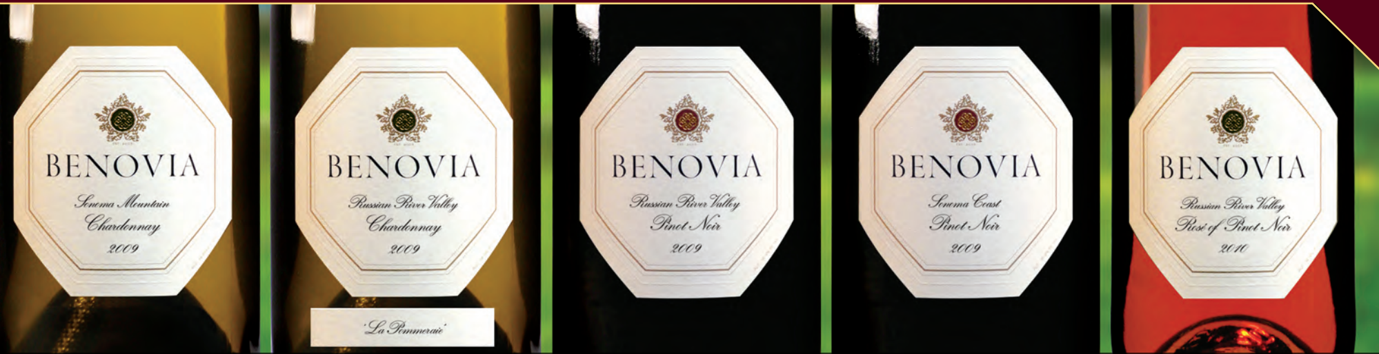
SPRING RELEASE WINES